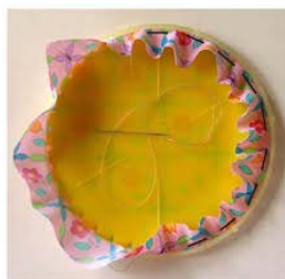
using Clover template