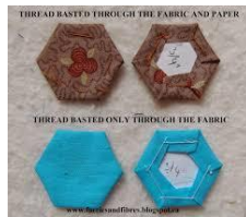
baste only through fabric not card stock