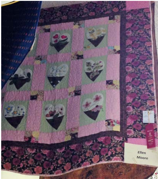
Ellen Moore- 2 nd Place ribbon