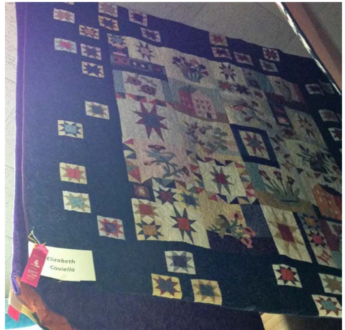
Liz Coviello- 2 nd Place ribbon